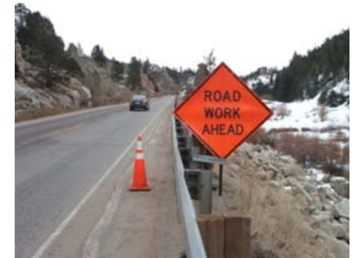
Roadwork sign with proposed device