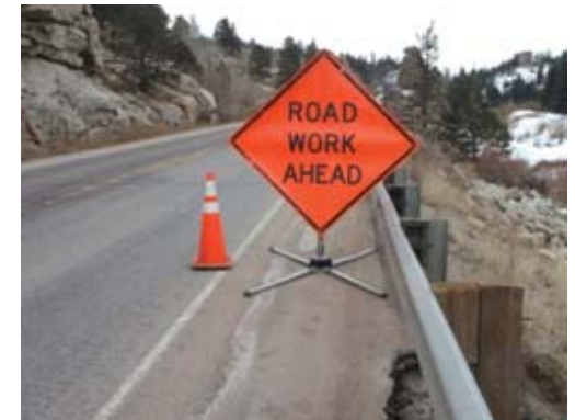
Roadwork sign with typical installation

Patrol has used this device several times, and it has been used with both cloth and metal signs without any problems. It makes for a safer environment for the motoring public and roadway maintenance personnel. A flag could also be added to the sign to attract additional attention.