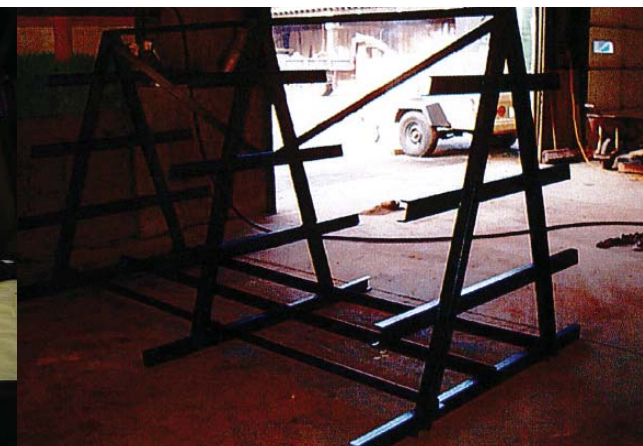
Images from the 2011 Build a Better Mousetrap: National Competition